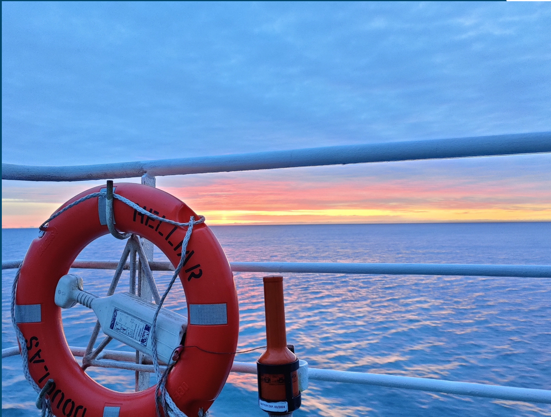
North Sea by Ferenc Lukacs Baranyay