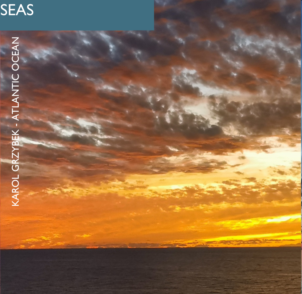
KAROL GRZYBEK - ATLANTIC OCEAN