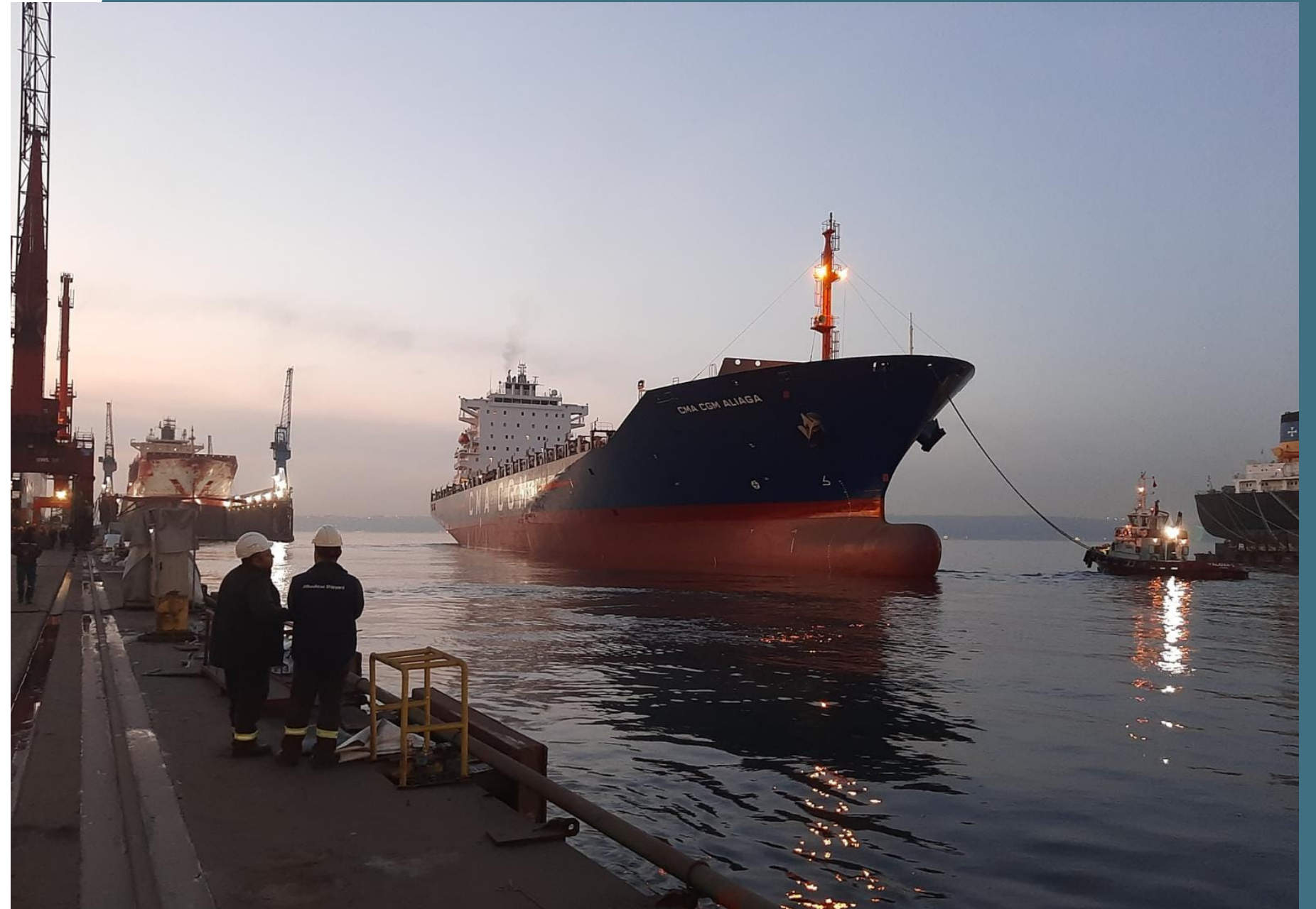
Departing Besiktas Ship Yard, Turkey by Jaroslaw Klusik