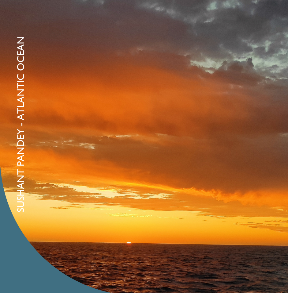
SUSHANT PANDEY - ATLANTIC OCEAN