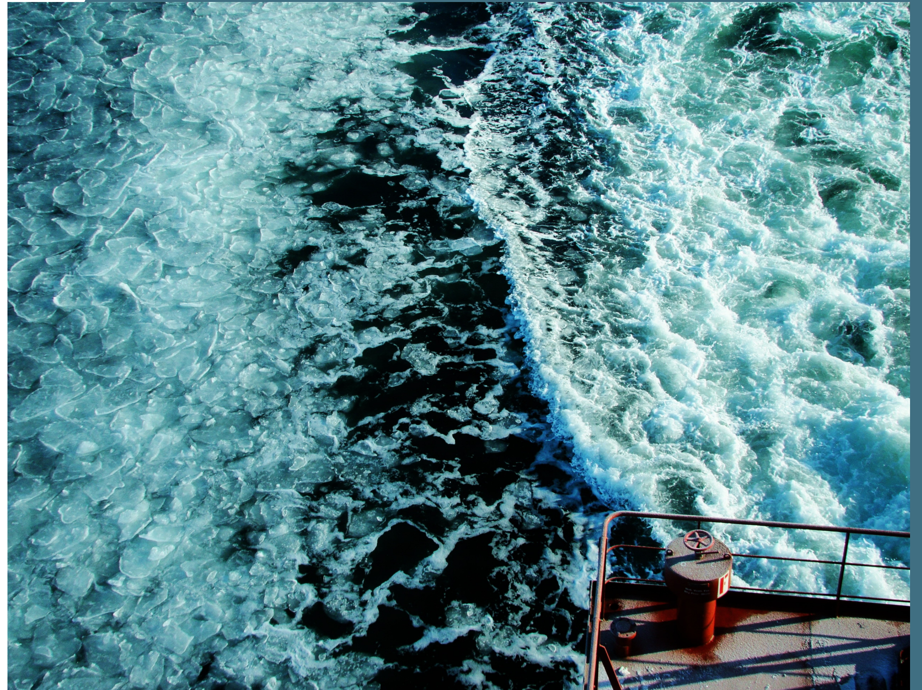
Holy Loch, Scotland