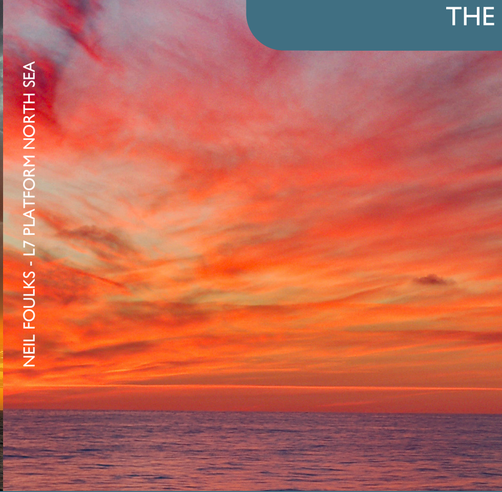
NEIL FOULKS - L7 PLATFORM NORTH SEA