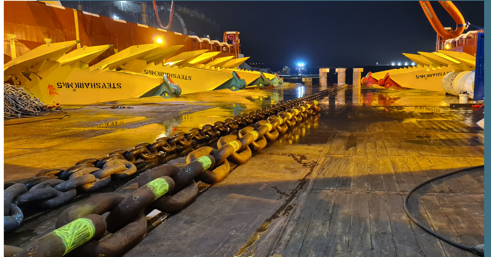
Deep water anchor handling by Kirk Colwell