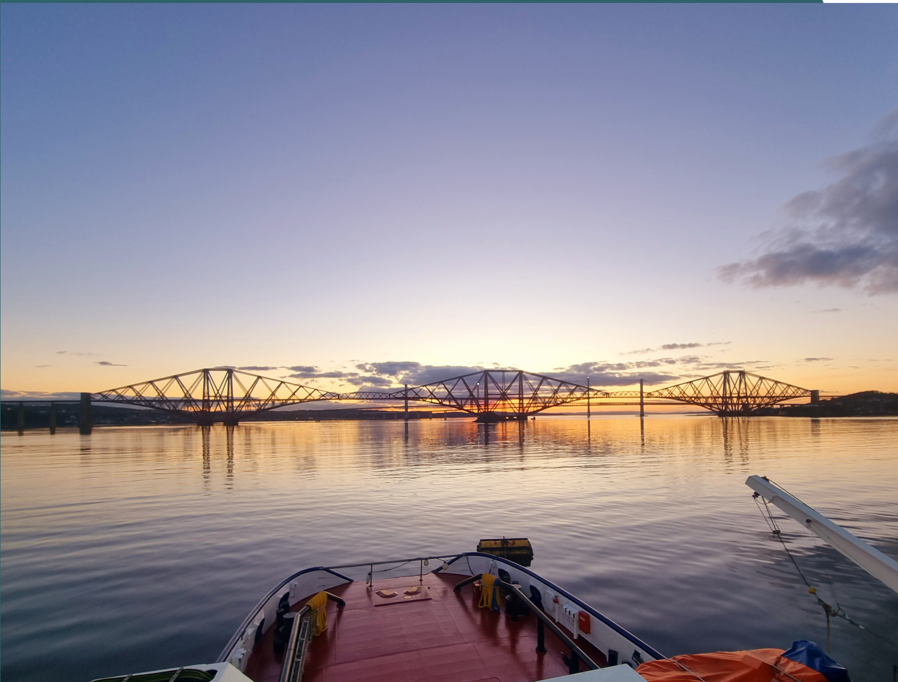
Forth Rail Bridge taken from Hound Point