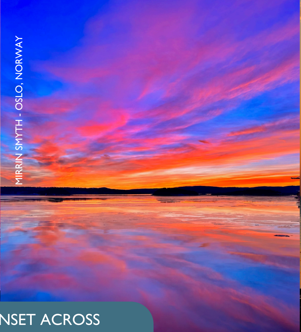
MIRRI SMYTH - OSLO, NORWAY