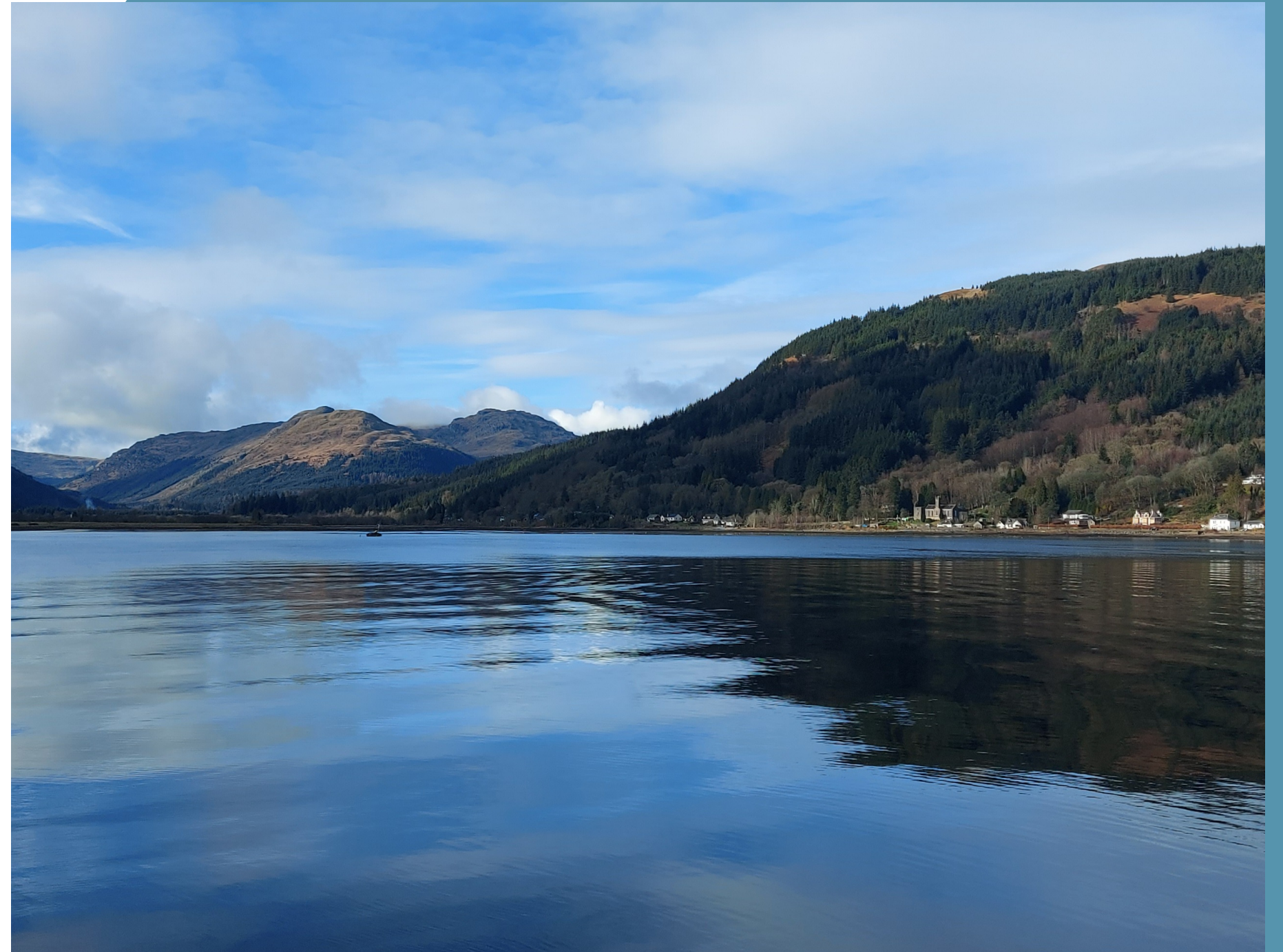
Holy Loch, Scotland