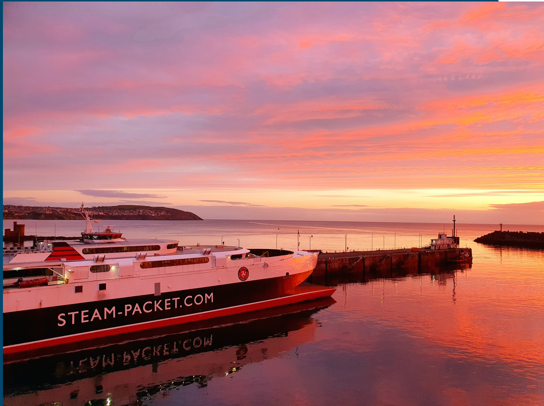
Isle of Man Sunrise