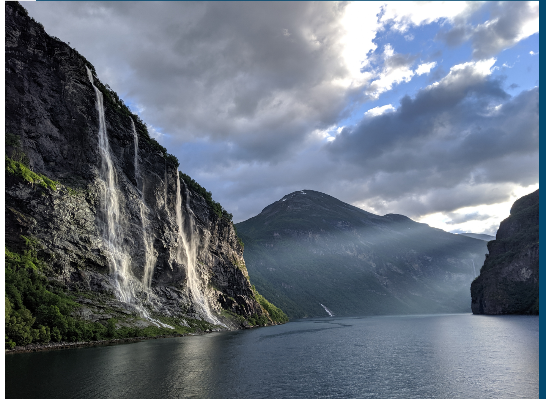
Geirangerfjord, Norway by Gavin Colvine